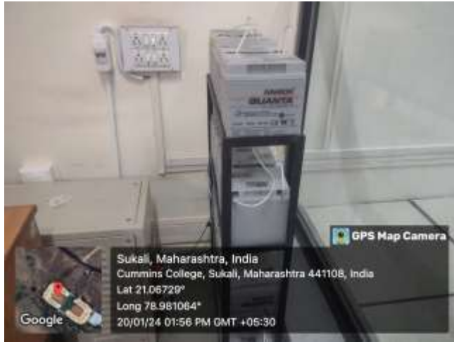
UPS_Computer Center Lab