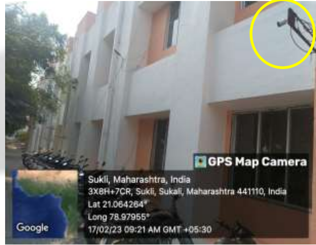
CCTV Camera_outside Wing B