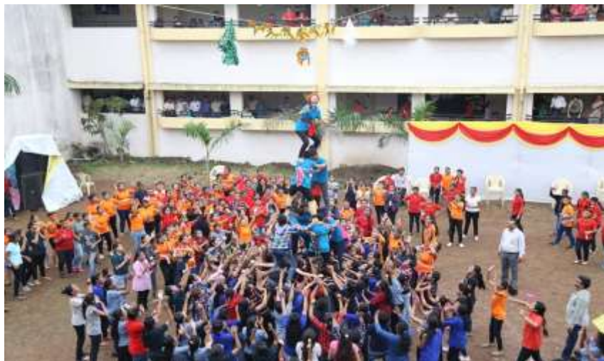
Cultural Event_Dahi Handi (2021)