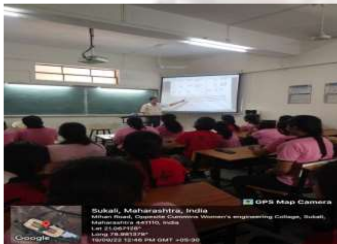
PC, Projector, Speaker, LAN_Room No. 25