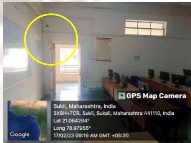
CCTV Camera_Computer Center