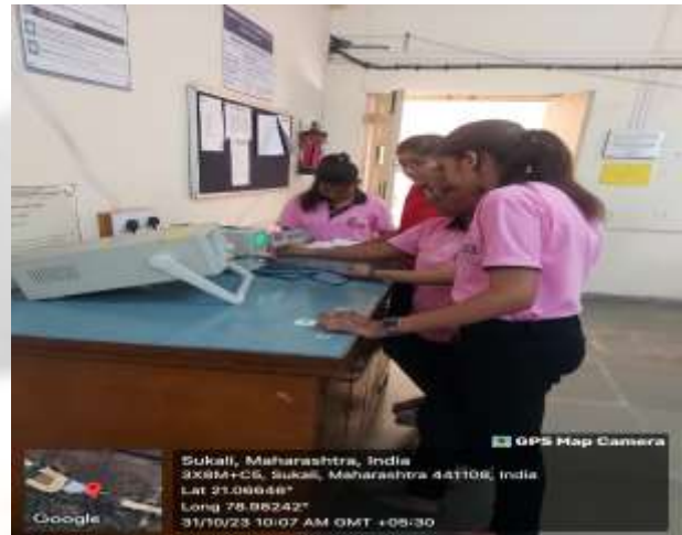
Sukali, Maharashtra, India 3X08+CG, Sukali, Maharashtra 441108, India Lat 21.066468° Long 78.882427° 31/10/23 10:07 AM GMT +05:30