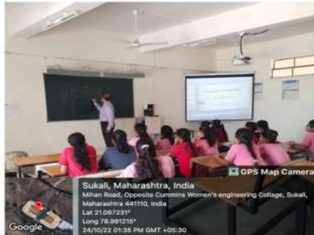
Room No. 47