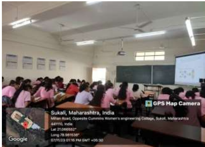
Room No. 28