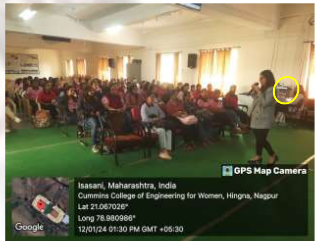
PC, LAN_Seminar Hall 'Gargi'