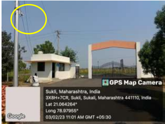
CCTV Camera_Entry Gate