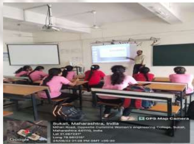
Room No. 46