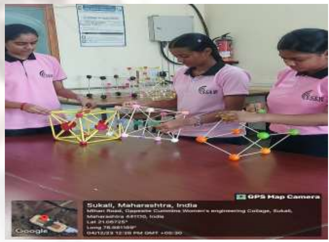
Sukali, Maharashtra, India Mihan Road, Opposite Cummins Women's engineering College, Sukali, Maharashtra 441108, India Lat 21.067292° Long 78.881279° 04/11/23 12:38 PM GMT +05:30