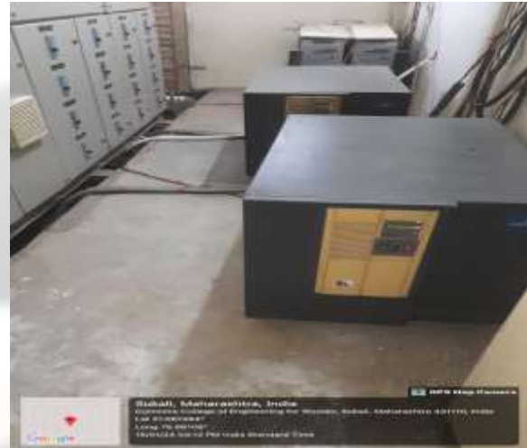
UPS_Panel Room (Wing A)