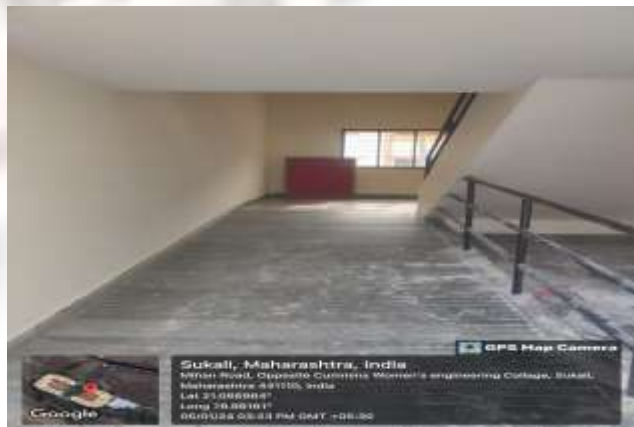
Slope_Entrance of Wing A