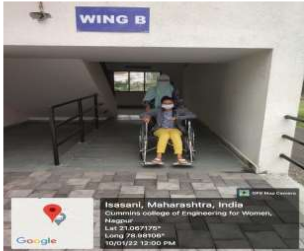
Slope_Entrance of Wing B