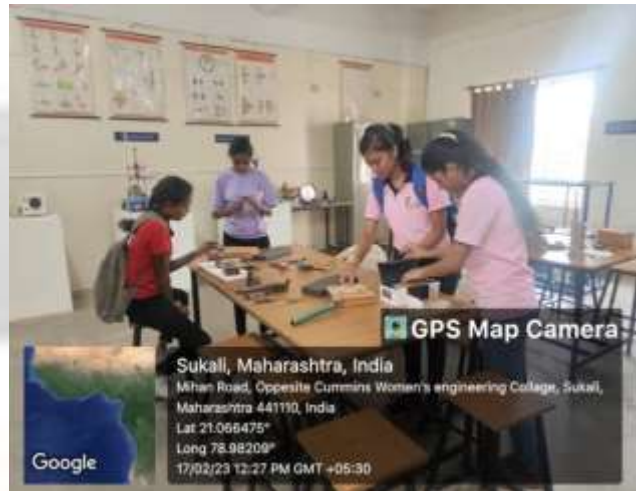
Dynamics of Machine