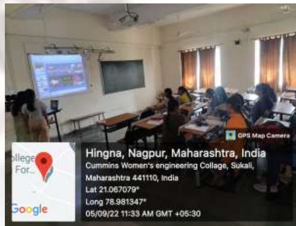
PC, Projector, Speaker, LAN_Room No. 46