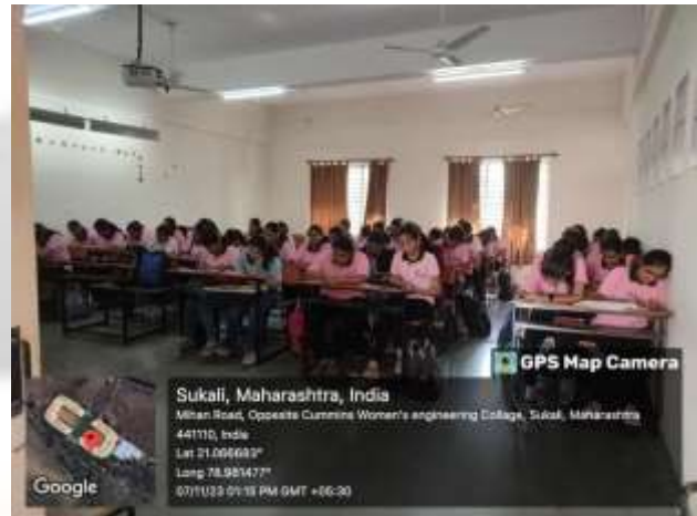
Room No. 51