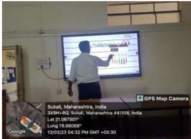
Smart Board, PC, LAN_Room No. 22