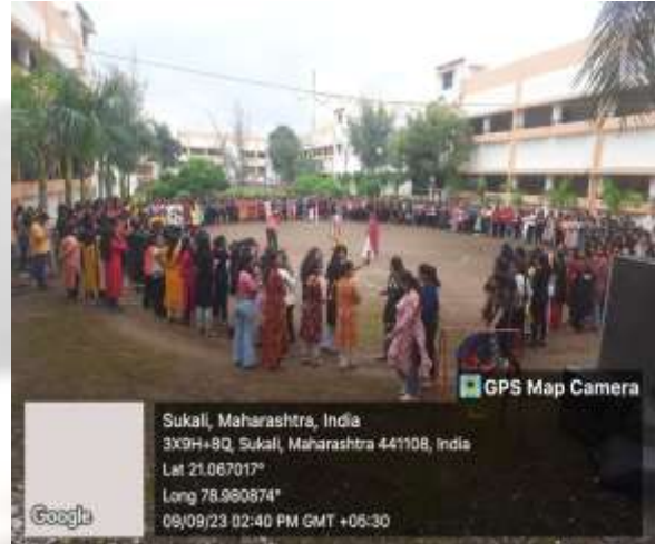
Cultural Event_ Dahi Handi (09-09-23)