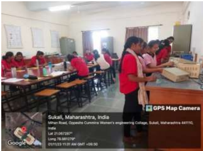
Sukali, Maharashtra, India Mihan Road, Opposite Cummins Women's engineering College, Sukali, Maharashtra 44110, India Lat 21.067292° Long 78.881279° 05/11/23 11:31 AM GMT +05:30