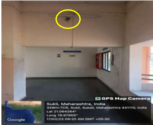
CCTV Camera_Wing A (Ground Floor)