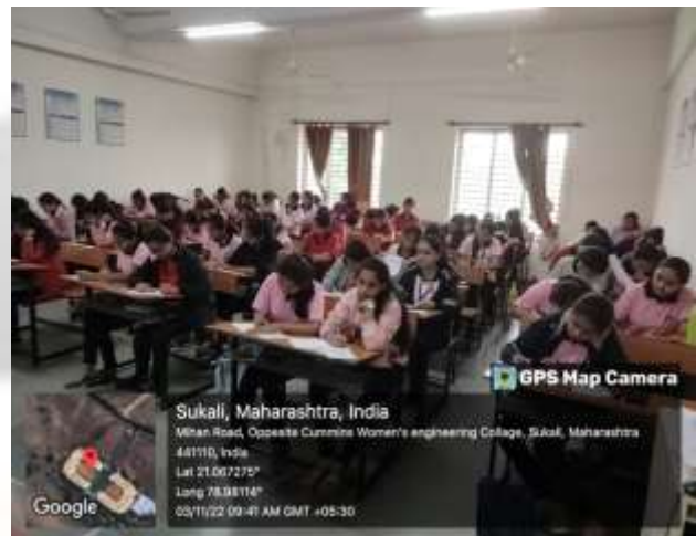
Room No. 24