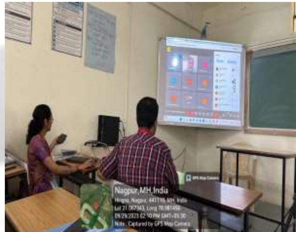
PC, Projector, Speaker, LAN_Room No. 24