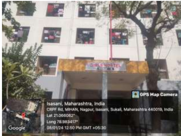
Hostel building_ Wing A