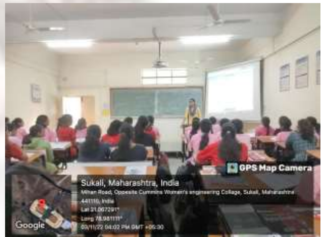
Room No. 27