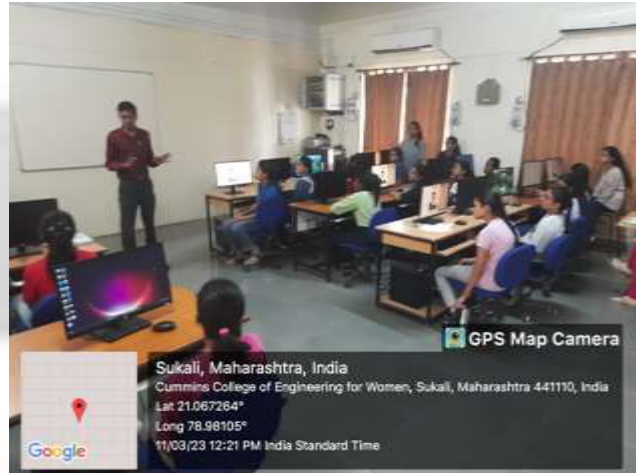
Artificial Intelligence & Machine learning