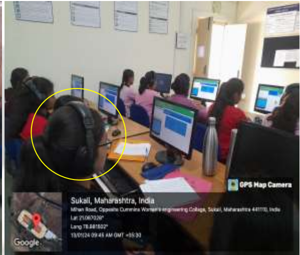
PC, Headphones, LAN _ Language Lab