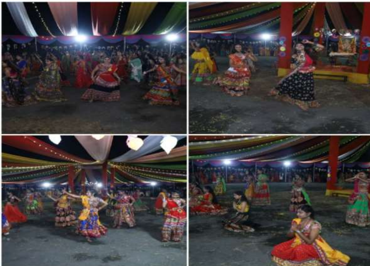
Cultural Event_Garba (2021)