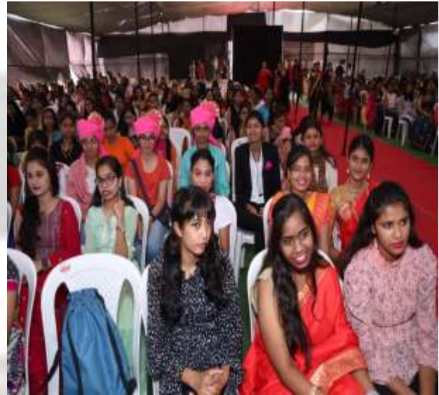
Cultural Event_Anannya (04-03-23)