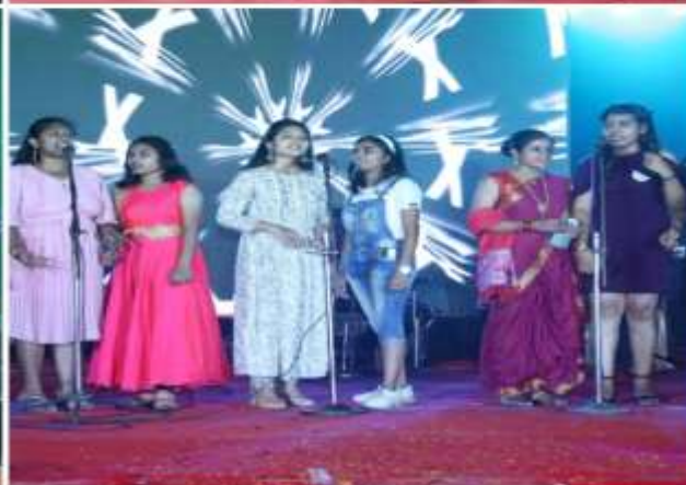
Cultural Event_Anannya (2022)