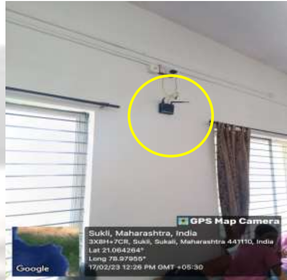
Wi-Fi Router_Classroom_Wing B