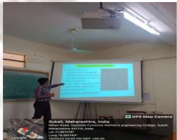
PC, Projector, Speaker, LAN_Room No. 27