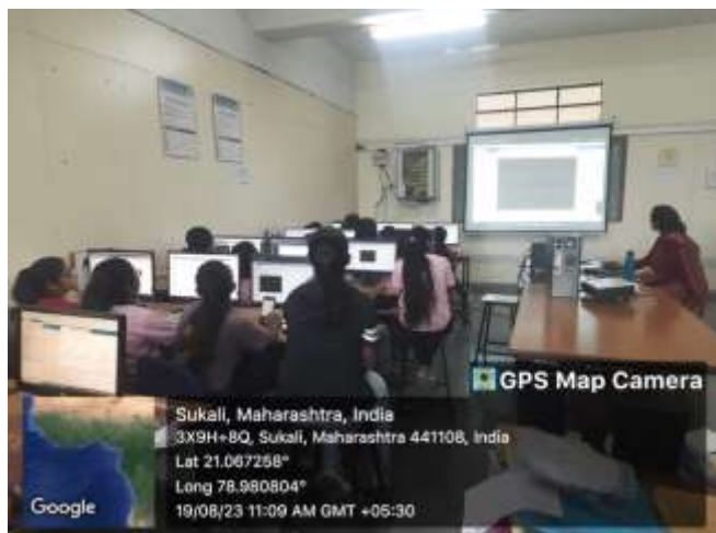
PC, Projector, Speaker, LAN_