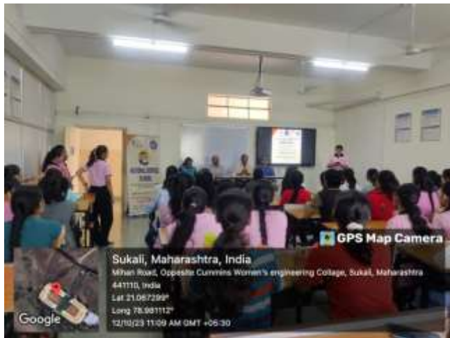
Room No. 22