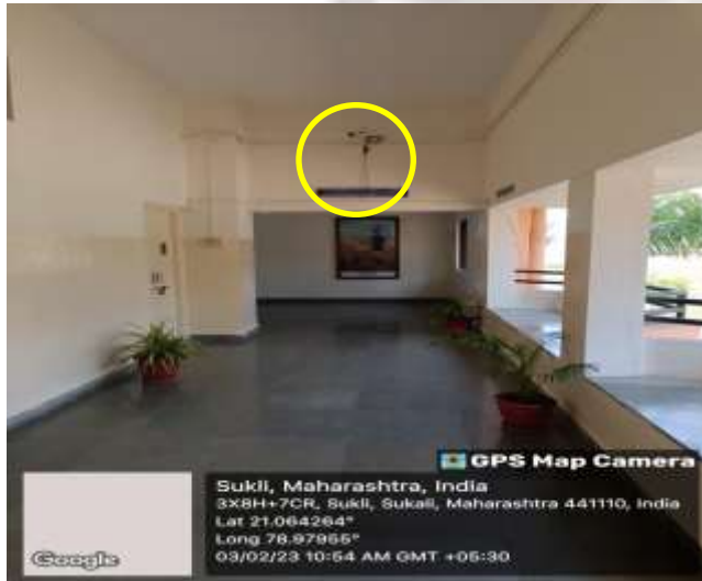
CCTV Camera_Wing B (Ground Floor)