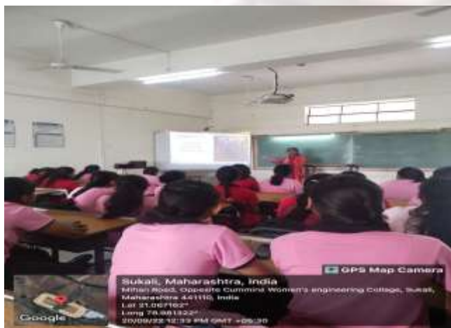
Room No. 42