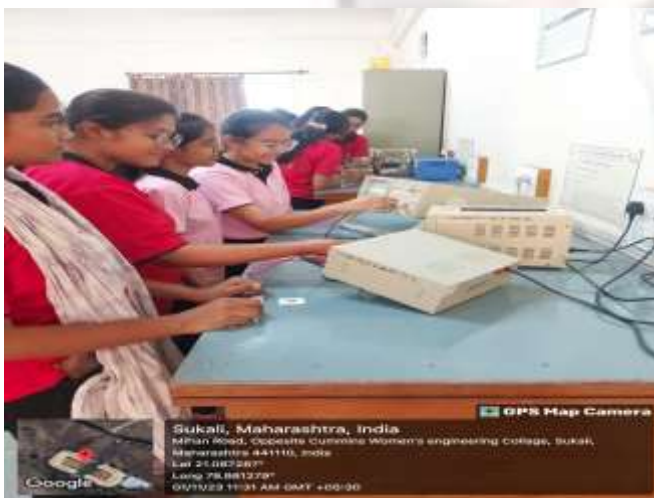
Sukali, Maharashtra, India Mihan Road, Opposite Cummins Women's engineering College, Sukali, Maharashtra 441110, India Lat 21.067292° Long 78.881279° 05/11/23 11:31 AM GMT +05:30