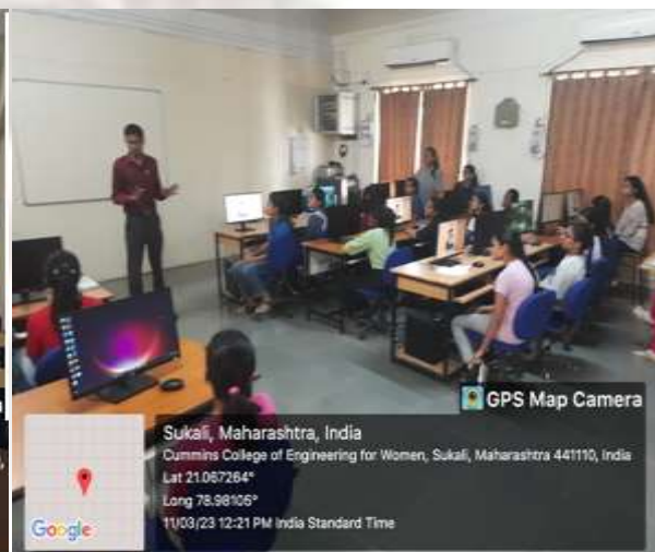
PC, LAN_Artificial Intelligence & Machine learning