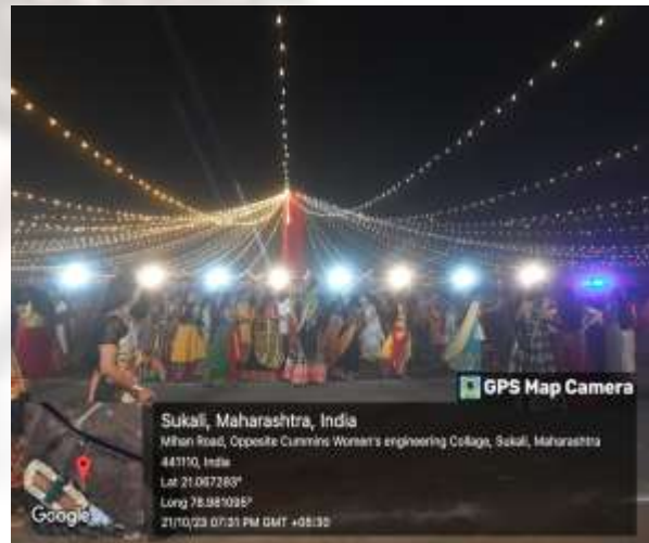
Cultural Event_ Garba (21-10-23)