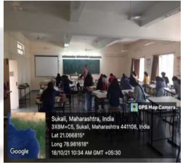
PC, Projector, Speaker, LAN_Reading Room