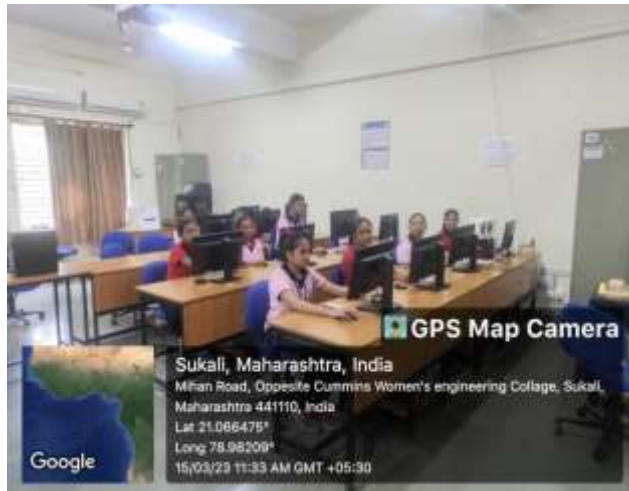
Computer Aided Design