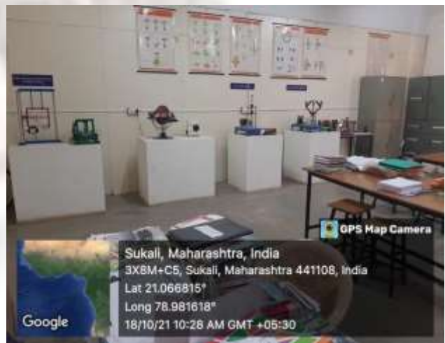
Kinematics of Machine