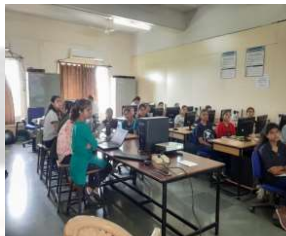
Digital Signal processing