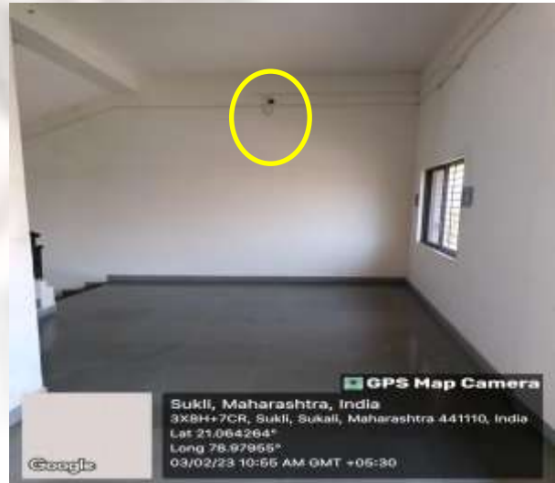
CCTV Camera_Wing B (First Floor)