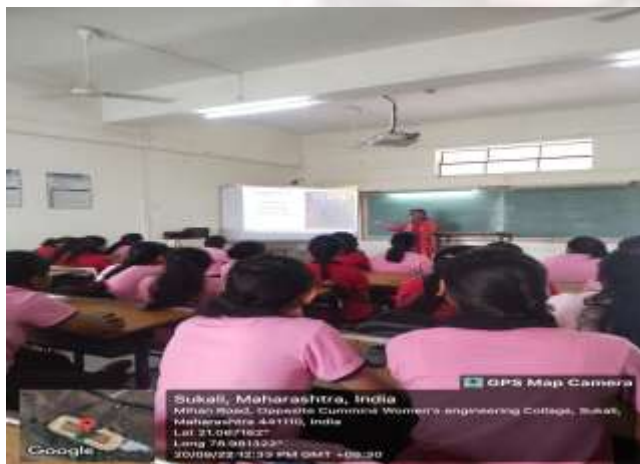
PC, Projector, Speaker, LAN_Room No. 42