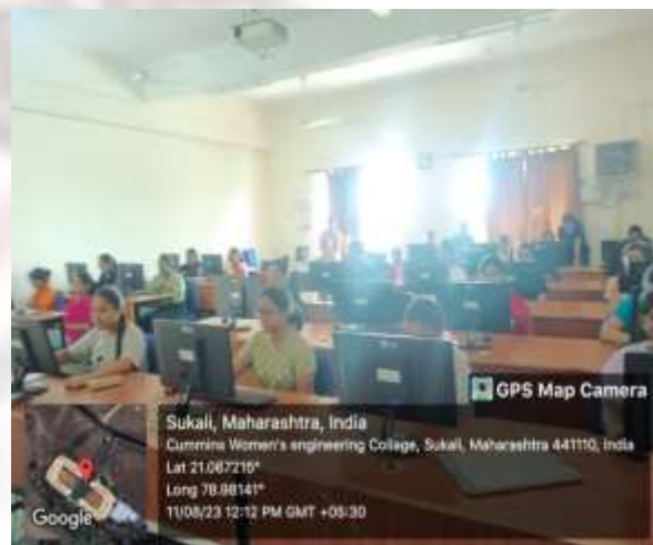
PC, LAN_Advanced Software