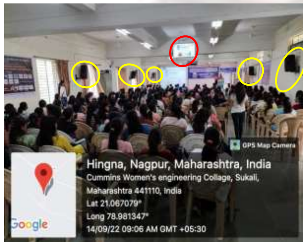
Speakers, TV, LAN_Seminar Hall 'Gargi'