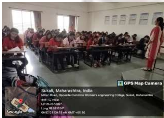
Room No. 26