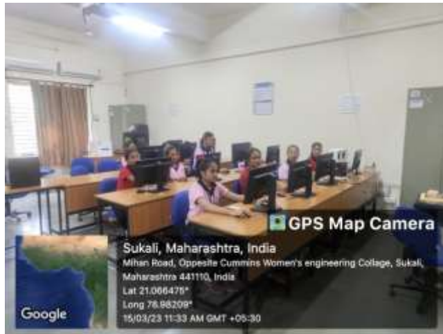
PC, LAN_Computer Aided Design