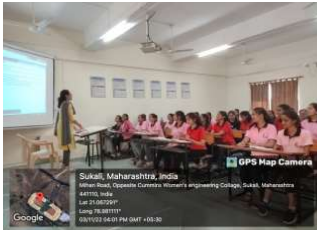
PC, Projector, Speaker, LAN_Room No. 28