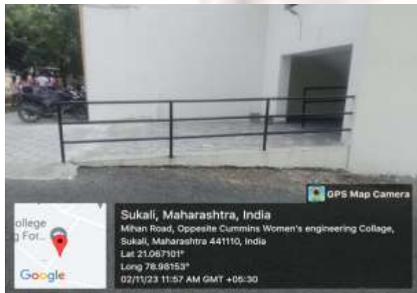
Slope_Entrance of Wing B