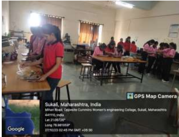
Analog Circuit & design