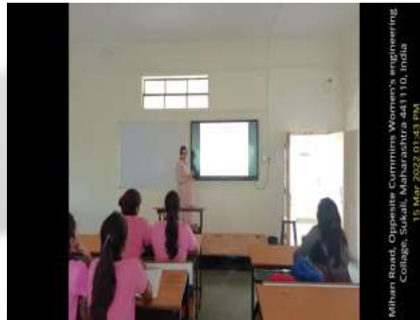
Smart board_Room No.40