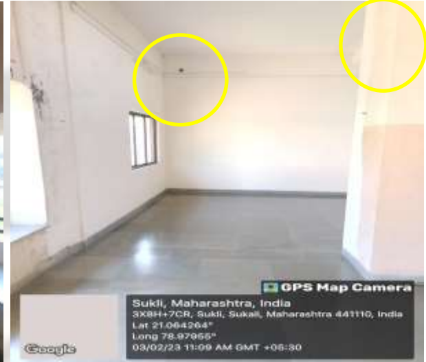
CCTV Camera_Wing A (First Floor)