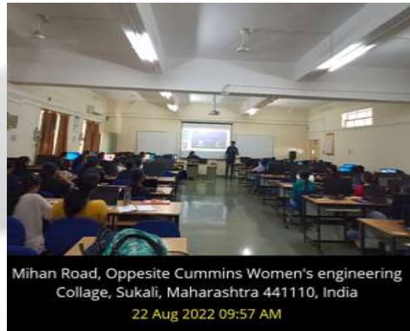
PC, Projector, Speaker, LAN_Computer Centre